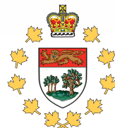
Honourable Wassim Salamoun, MD, OPEI Lieutenant Governor of Prince Edward Island

A handwritten signature in black ink, reading "Wassim Salamoun". The signature is fluid and cursive, with the first name being the most prominent.