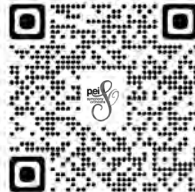
COMMUNITY FOUNDATION OF PEI